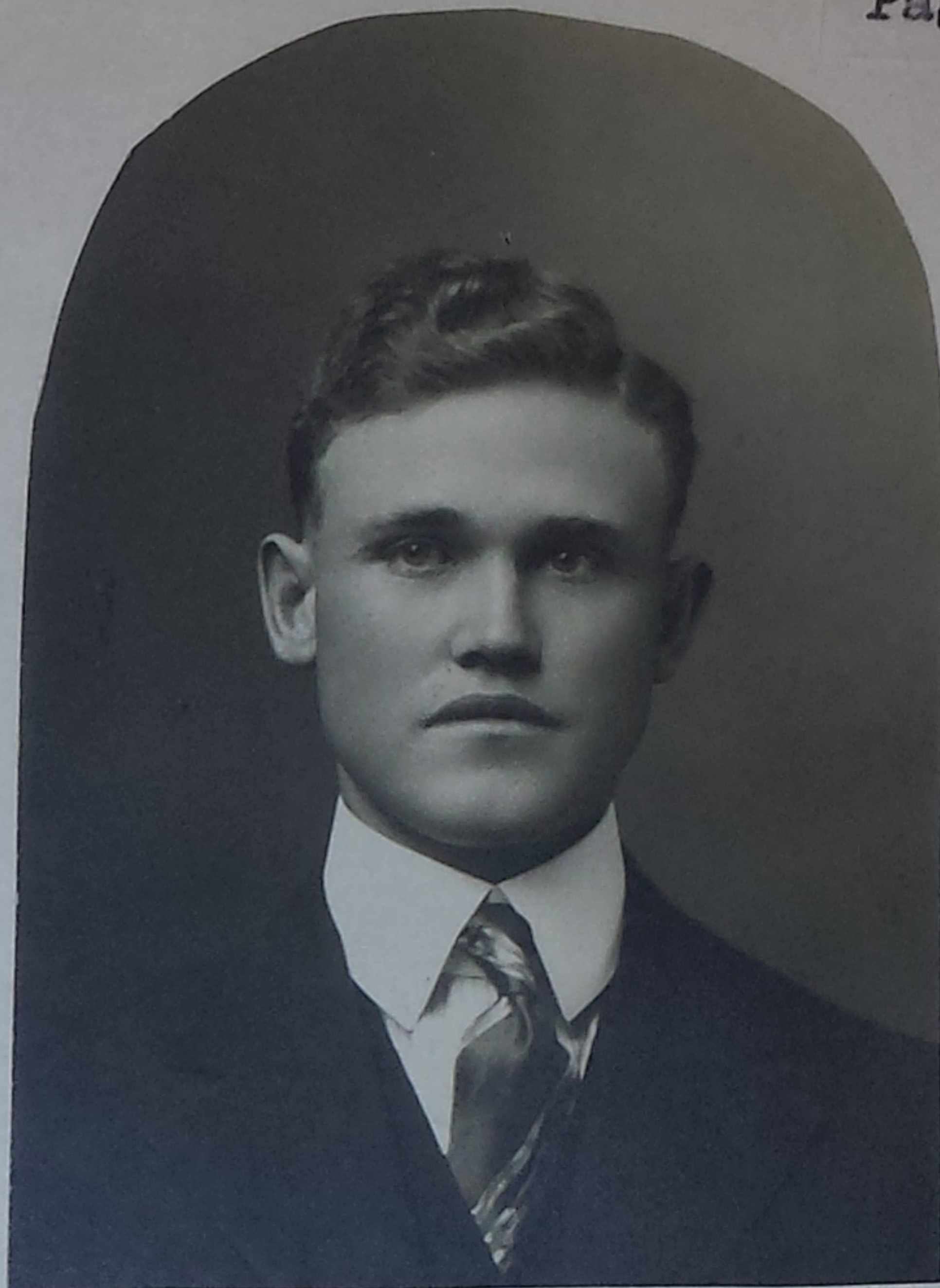
HORACE MARRIED IVY LEE 21 Sep 1910 They had 5 children